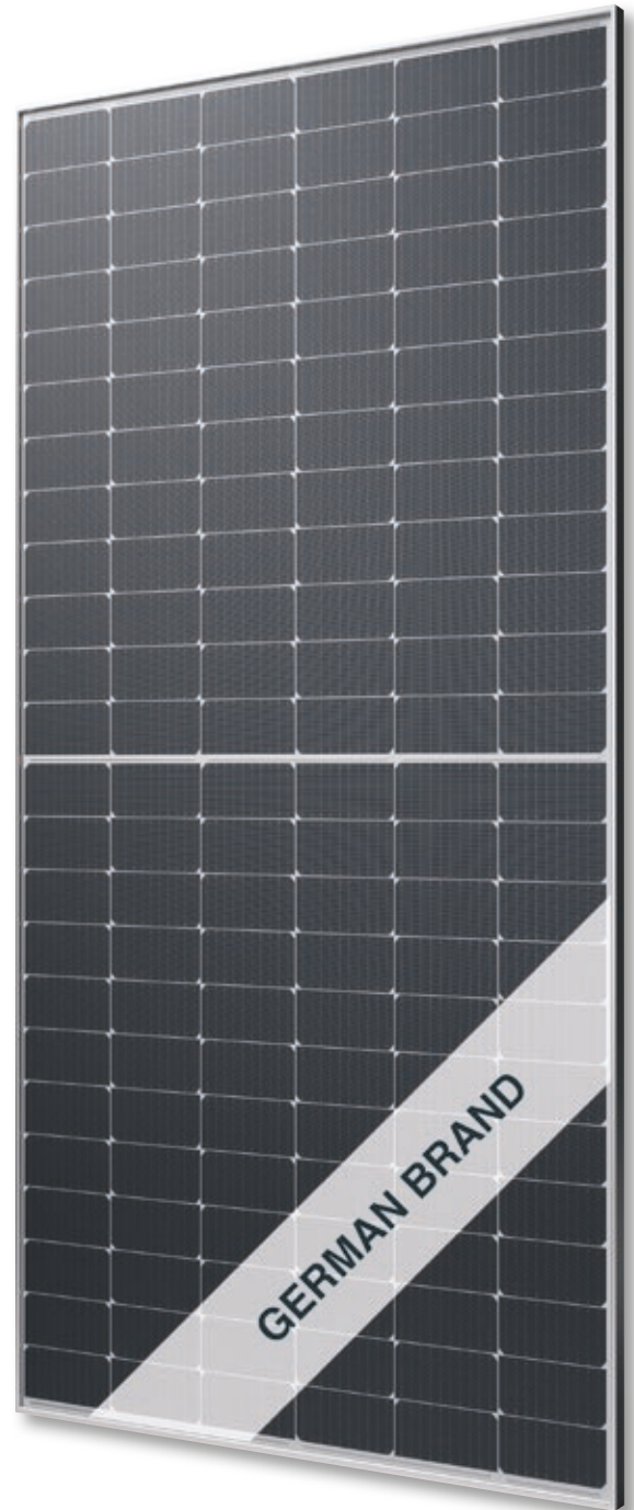
Fig. similar 144MHUSA230801A